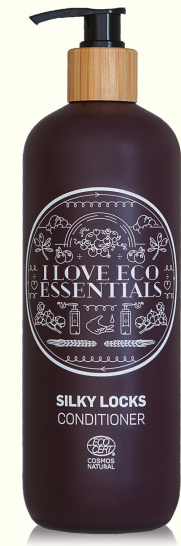
Conditioner 600ml. 'SILKY LOCKS' Also available with cap*