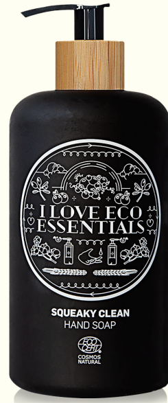
Hand soap 500ml. 'SQUEAKY CLEAN' Also available with cap*