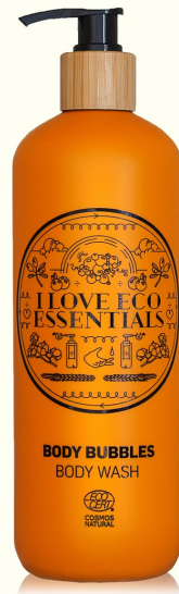
Body wash 600ml. 'BODY BUBBLES' Also available with cap*