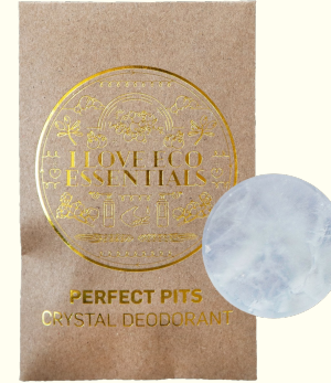
Crystal deodorant 'PERFECT PITS'