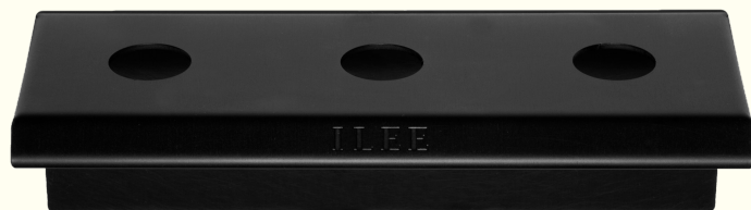
'WALL HANGER' Triple holder