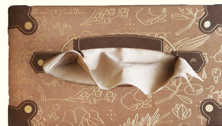
Bamboo tissue Box 'WICKER WIPES'