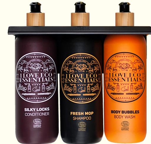
'WALL HANGER' Triple holder