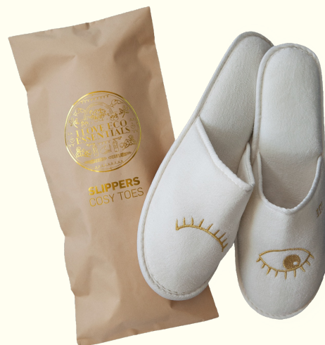
Slippers 'COSY TOES'