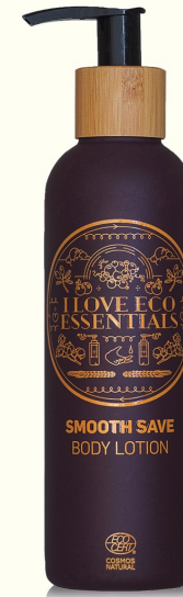
Body lotion 250ml. 'SMOOTH SAVE' Also available with cap*