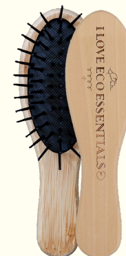
Bamboo hair brush 'Brush on!'