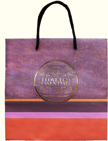
Recycled lux bags 'GOLD WITH HANDLE'