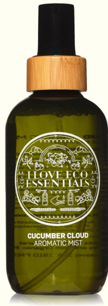
Room spray 200ml. 'CUCUMBER CLOUD'