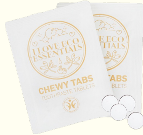
Toothpaste tablets 'CHEWY TABS'