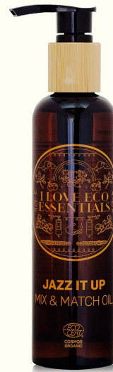
Mix & Match oil 150ml. 'JAZZ IT UP'