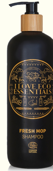
Shampoo 600ml. 'FRESH MOP' Also available with cap*