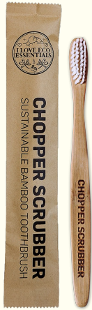
Bamboo toothbrush 'CHOPPER SCRUBBER'