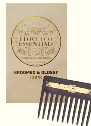
Comb 'Groomed & Glossy'