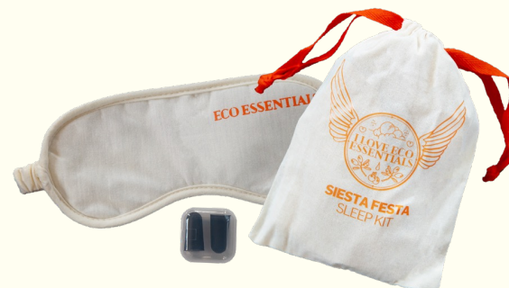
Sleep kit 'SIESTA FESTA'