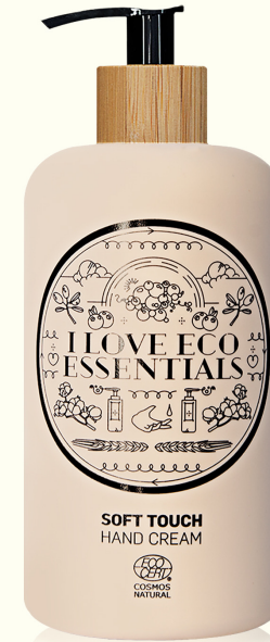
Hand cream 500ml. 'SOFT TOUCH' Also available with cap*