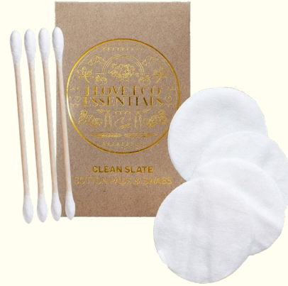
Cotton pads & buds 'CLEAN SLATE'